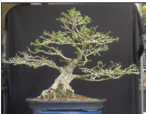
The Bonsai in 2014